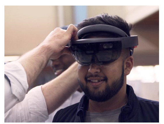
Use of new technologies in building construction training