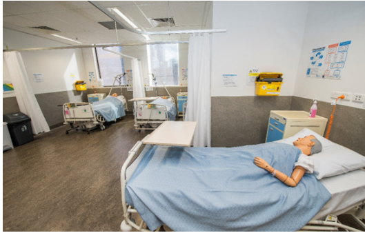
Simulated nursing ward-Holmesglen.