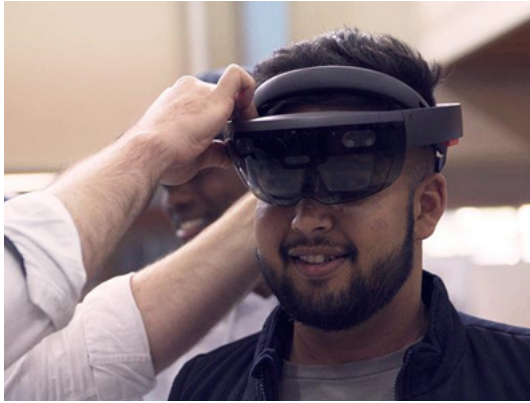
Use of new technologies in building construction training