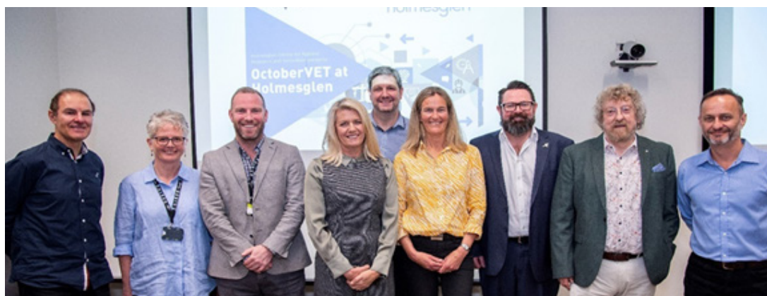
Holmesglen presenters at OctoberVET